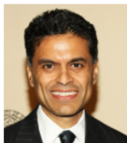
Fareed Zakaria, Journalist, CNN, Washington

This edition's program promises to bring together the world's best thinkers and present tools to guide managers and companies to achieve a balance between growth and sustainability, in the short, medium, and long term, in its multiple dimensions – social, economic, environmental, technological, and cultural.